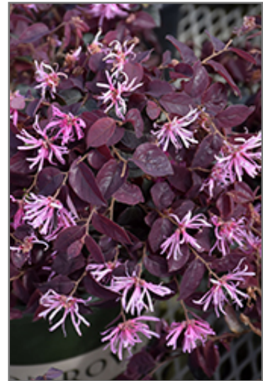
Sizzling Pink Chinese Fringeflower flowers