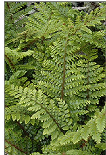
Japanese Tassel Fern foliage