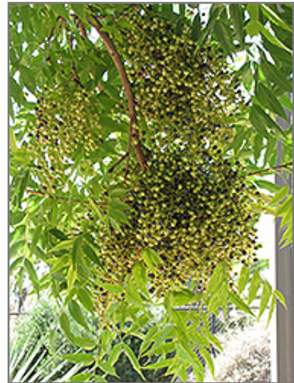
Chinese Pistache fruit

This tree should only be grown in full sunlight. It is very adaptable to both dry and moist growing conditions, but will not tolerate any standing water. It is not particular as to soil type or pH. It is highly tolerant of urban pollution and will even thrive in inner city environments. This species is not originally from North America.