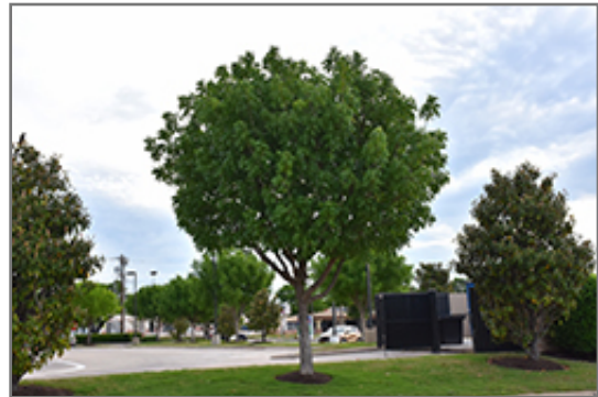
Chinese Pistache

Chinese Pistache is recommended for the following landscape applications;