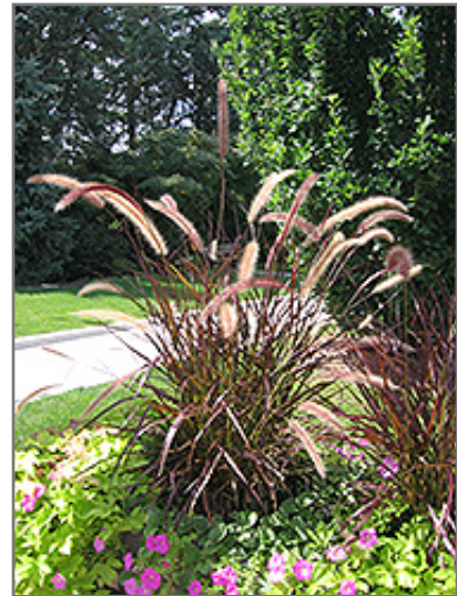
Purple Fountain Grass flowers

Purple Fountain Grass is recommended for the following landscape applications;