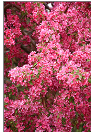
Prairifire Flowering Crab flowers