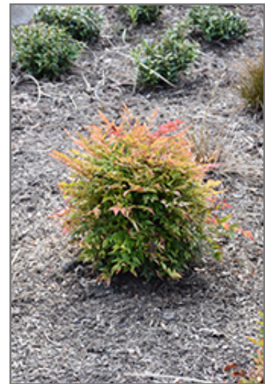
Gulf Stream Dwarf Nandina

Gulf Stream Dwarf Nandina is recommended for the following landscape applications;