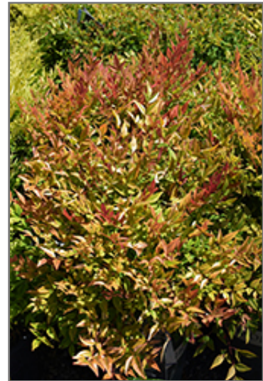
Gulf Stream Dwarf Nandina

This shrub performs well in both full sun and full shade. However, you may want to keep it away from hot, dry locations that receive direct afternoon sun or which get reflected sunlight, such as against the south side of a white wall. It does best in average to evenly moist conditions, but will not tolerate standing water. It is not particular as to soil type or pH. It is highly tolerant of urban pollution and will even thrive in inner city environments. This is a selected variety of a species not originally from North America.