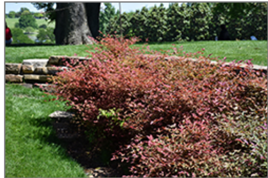
Flirt Nandina

Flirt Nandina is recommended for the following landscape applications;