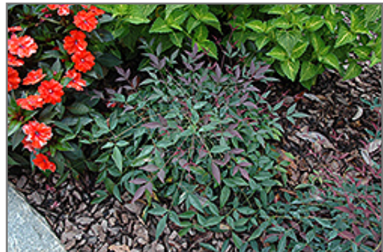
Flirt Nandina