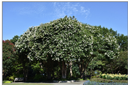
Natchez Crapemyrtle in bloom