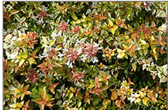
Kaleidoscope Abelia flowers

Kaleidoscope Abelia is a multi-stemmed evergreen shrub with a mounded form. Its average texture blends into the landscape, but can be balanced by one or two finer or coarser trees or shrubs for an effective composition.