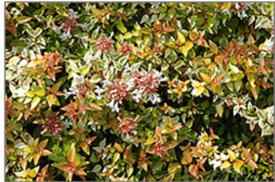
Kaleidoscope Abelia flowers

Kaleidoscope Abelia is a multi-stemmed evergreen shrub with a mounded form. Its average texture blends into the landscape, but can be balanced by one or two finer or coarser trees or shrubs for an effective composition.