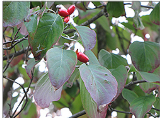
Cherokee Chief Flowering Dogwood fruit

In Middle Tennessee, Dogwoods perform very well as understory trees, meaning they are planted under the canopy of larger shade trees. Alternatively, Dogwoods should ideally be planted in partial shade locations.