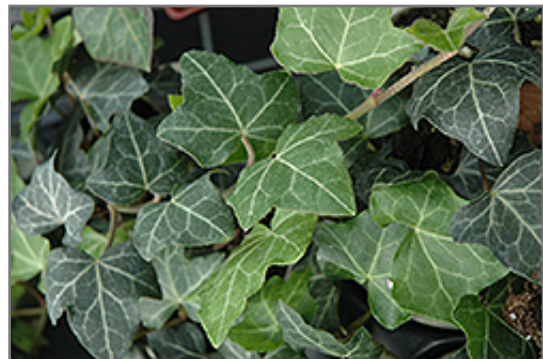
Baltic Ivy foliage

Baltic Ivy is recommended for the following landscape applications;