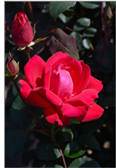
Double Knock Out Rose flowers