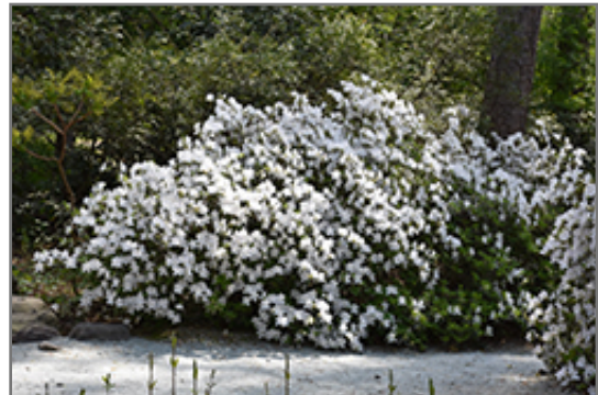
Delaware Valley White Azalea in bloom