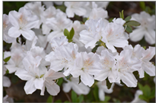
Delaware Valley White Azalea flowers

Delaware Valley White Azalea is recommended for the following landscape applications;