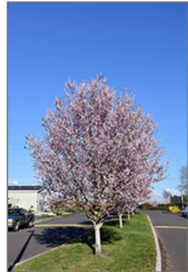
Krauter Vesuvius Plum in bloom

Krauter Vesuvius Plum is a deciduous tree with an upright spreading habit of growth. Its average texture blends into the landscape, but can be balanced by one or two finer or coarser trees or shrubs for an effective composition.