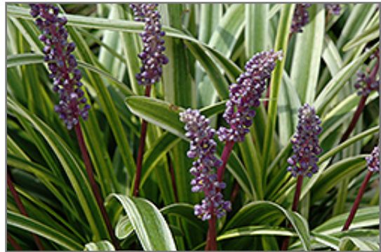
Variegata Lily Turf flowers

This is a relatively low maintenance plant, and is best cleaned up in early spring before it resumes active growth for the season. It has no significant negative characteristics.