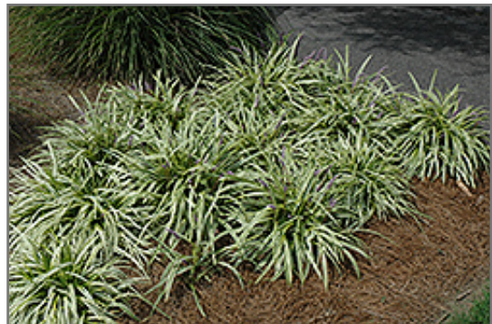
Variegata Lily Turf in bloom