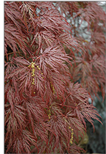
Inaba Shidare Cutleaf Japanese Maple foliage

This is a relatively low maintenance tree, and should only be pruned in summer after the leaves have fully developed, as it may 'bleed' sap if pruned in late winter or early spring. It has no significant negative characteristics.