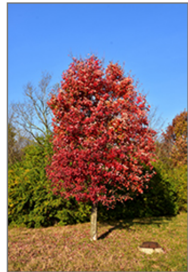
Autumn Flame Red Maple in fall

This is a relatively low maintenance tree, and should only be pruned in summer after the leaves have fully developed, as it may 'bleed' sap if pruned in late winter or early spring. It has no significant negative characteristics.