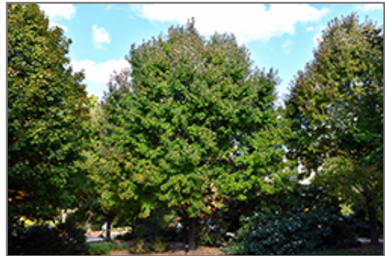
Autumn Flame Red Maple

Autumn Flame Red Maple will grow to be about 50 feet tall at maturity, with a spread of 40 feet. It has a high canopy with a typical clearance of 7 feet from the ground, and should not be planted underneath power lines. As it matures, the lower branches of this tree can be strategically removed to create a high enough canopy to support unobstructed human traffic underneath. It grows at a medium rate, and under ideal conditions can be expected to live for 80 years or more.