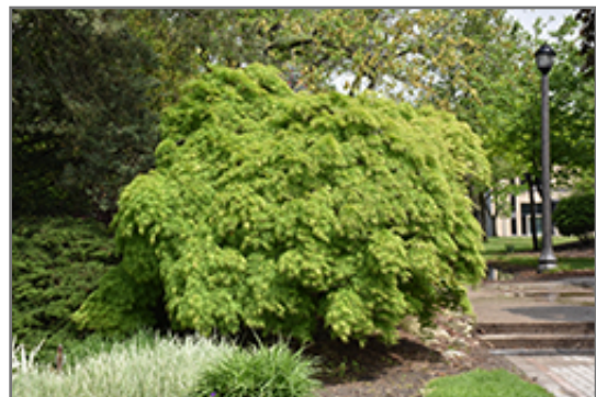
Cutleaf Japanese Maple