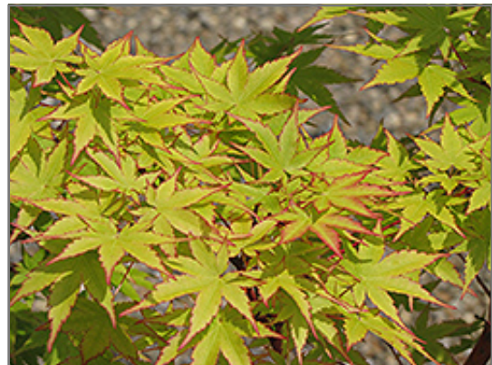
Coral Bark Japanese Maple foliage

This is a relatively low maintenance tree, and should only be pruned in summer after the leaves have fully developed, as it may 'bleed' sap if pruned in late winter or early spring. It has no significant negative characteristics.