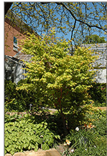
Coral Bark Japanese Maple