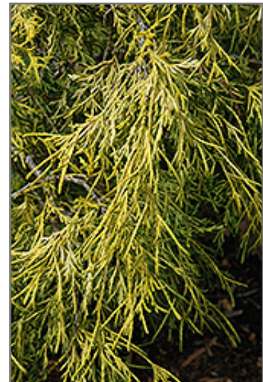
Lemon Thread Falsecypress foliage