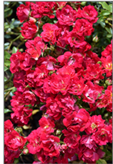
Red Drift Rose flowers