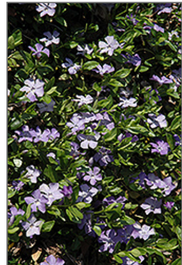
Common Periwinkle in bloom