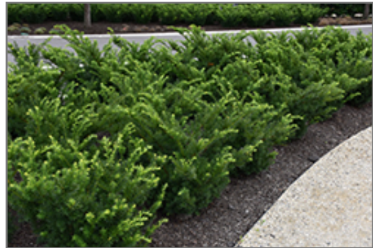
Densiformis Yew

Densiformis Yew is recommended for the following landscape applications;