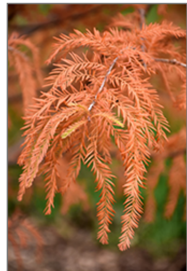
Baldcypress in fall