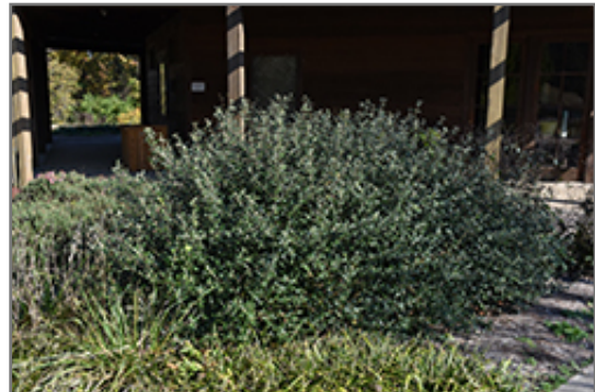
Prague Viburnum