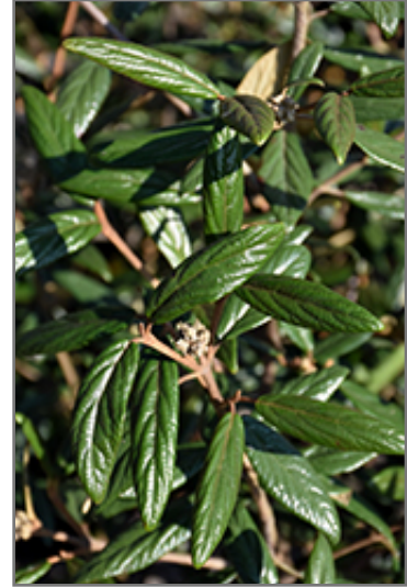
Prague Viburnum foliage

This shrub does best in full sun to partial shade. It prefers to grow in average to moist conditions, and shouldn't be allowed to dry out. It is not particular as to soil type or pH. It is highly tolerant of urban pollution and will even thrive in inner city environments. This particular variety is an interspecific hybrid.