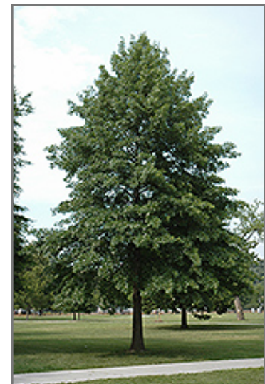
Pin Oak