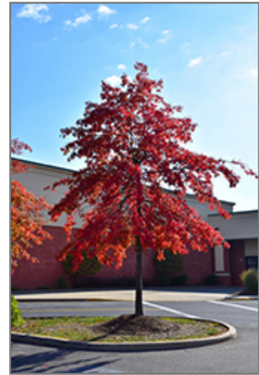
Pin Oak in fall