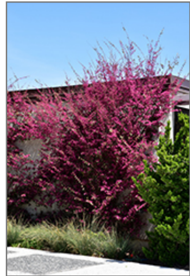
Red-Flowered Chinese Fringeflower in bloom

In Middle Tennessee, Loropetalum is semi-evergreen. For it to perform best, plant this shrub in a protected area from wind.