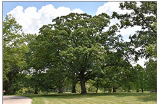
White Oak

This tree will require occasional maintenance and upkeep, and is best pruned in late winter once the threat of extreme cold has passed. It is a good choice for attracting squirrels to your yard. Gardeners should be aware of the following characteristic(s) that may warrant special consideration;