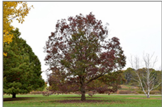
White Oak in fall

White Oak will grow to be about 90 feet tall at maturity, with a spread of 70 feet. It has a high canopy of foliage that sits well above the ground, and should not be planted underneath power lines. As it matures, the lower branches of this tree can be strategically removed to create a high enough canopy to support unobstructed human traffic underneath. It grows at a slow rate, and under ideal conditions can be expected to live to a ripe old age of 300 years or more; think of this as a heritage tree for future generations!