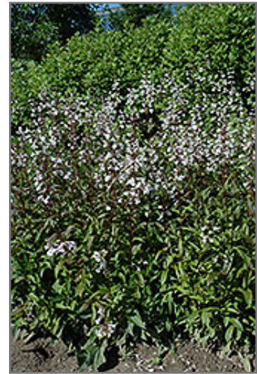
Husker Red Beard Tongue in bloom

When you see the "Riverbend Nurseries' Tried & True" label, you can rest assured that our experts have determined that this plant is especially well-adapted to thrive in Middle Tennessee! Many (but not all) "Tried & True" plants are native to our area. Ask us for tips on how to plant, water, & care for your new plant!