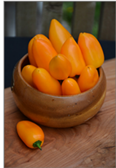
Lunchbox Yellow Sweet Pepper fruit