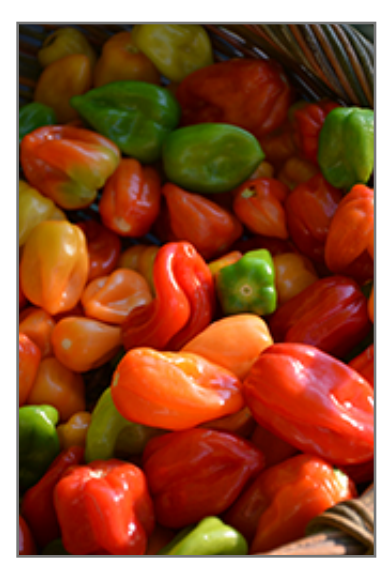
Habanero Pepper fruit