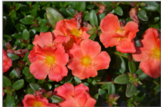
Pazzaz Orange Flare Portulaca flowers

This is a relatively low maintenance plant, and should not require much pruning, except when necessary, such as to remove dieback. It is a good choice for attracting butterflies and hummingbirds to your yard, but is not particularly attractive to deer who tend to leave it alone in favor of tastier treats. It has no significant negative characteristics.