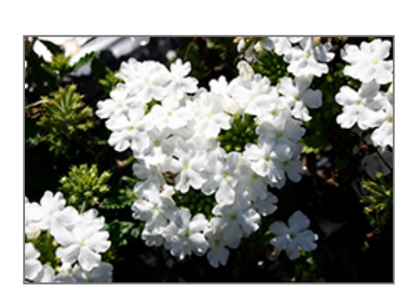
Firehouse White Verbena flowers