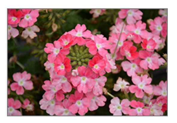
EnduraScape Pink Fizz Verbena flowers

EnduraScape Pink Fizz Verbena is recommended for the following landscape applications;