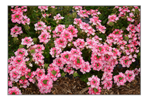
EnduraScape Pink Fizz Verbena flowers