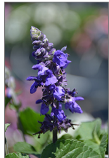
Big Blue Salvia flowers