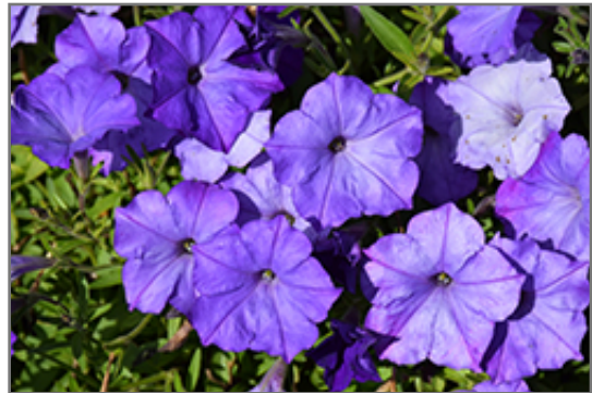
Easy Wave Lavender Sky Blue Petunia flowers

Easy Wave Lavender Sky Blue Petunia is a dense herbaceous annual with a trailing habit of growth, eventually spilling over the edges of hanging baskets and containers. Its medium texture blends into the garden, but can always be balanced by a couple of finer or coarser plants for an effective composition.