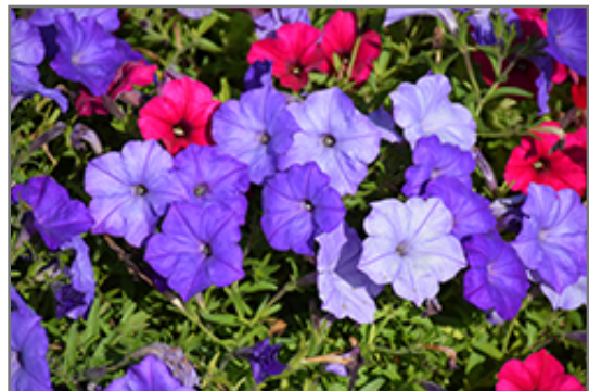
Easy Wave Lavender Sky Blue Petunia flowers