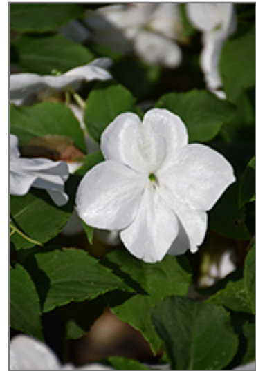
Beacon White Impatiens flowers

This plant will require occasional maintenance and upkeep, and should not require much pruning, except when necessary, such as to remove dieback. It has no significant negative characteristics.