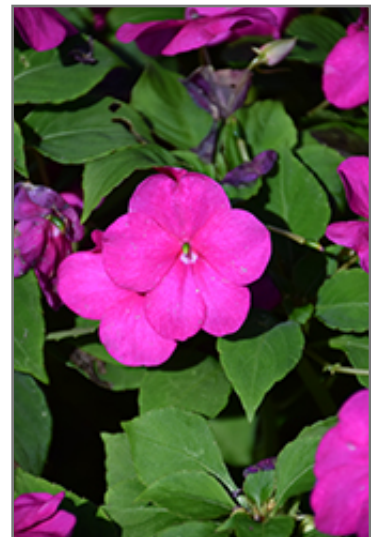
Beacon Violet Shades Impatiens flowers