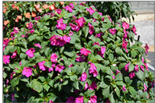
Beacon Violet Shades Impatiens in bloom

Beacon Violet Shades Impatiens will grow to be about 15 inches tall at maturity, with a spread of 12 inches. When grown in masses or used as a bedding plant, individual plants should be spaced approximately 8 inches apart. Its foliage tends to remain dense right to the ground, not requiring facer plants in front. This fast-growing annual will normally live for one full growing season, needing replacement the following year.