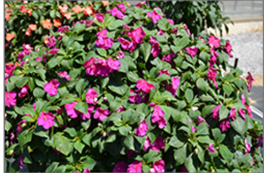
Beacon Violet Shades Impatiens in bloom

Beacon Violet Shades Impatiens will grow to be about 15 inches tall at maturity, with a spread of 12 inches. When grown in masses or used as a bedding plant, individual plants should be spaced approximately 8 inches apart. Its foliage tends to remain dense right to the ground, not requiring facer plants in front. This fast-growing annual will normally live for one full growing season, needing replacement the following year.