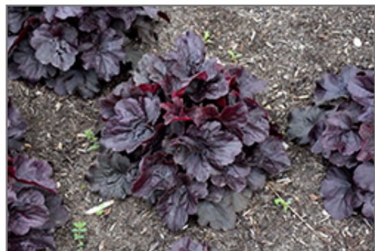
Northern Exposure Black Coral Bells