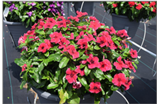
Tattoo Black Cherry Vinca in bloom