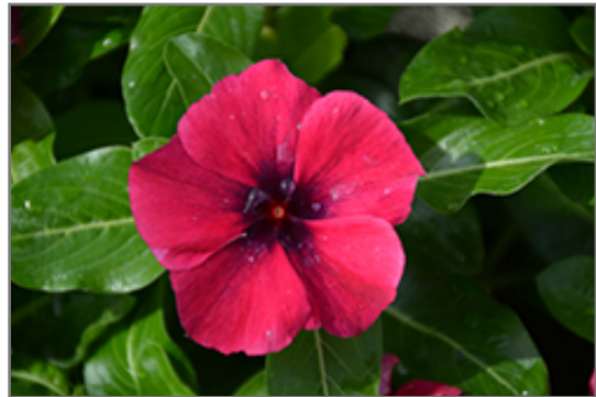
Tattoo Black Cherry Vinca flowers

Tattoo Black Cherry Vinca is a dense herbaceous annual with a mounded form. Its medium texture blends into the garden, but can always be balanced by a couple of finer or coarser plants for an effective composition.