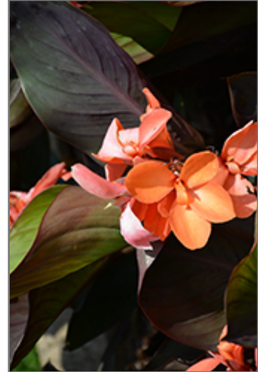
CannaSol Happy Wilma Canna flowers

This plant is native to the tropics and prefers growing in moist environments with evenly warm conditions all year round. In our climate, it is usually grown as an outdoor annual in the garden or in a container. If you want it to survive the winter, it can be brought in to the house and provided with special care, and then returned to the garden the following season. In its preferred tropical habitat, it can grow to be around 18 inches tall at maturity, with a spread of 14 inches. However, when grown as an annual or when overwintered indoors, it can be expected to perform differently, and its exact height and spread will depend on many factors; you may wish to consult with our experts as to how it might perform in your specific application and growing conditions.