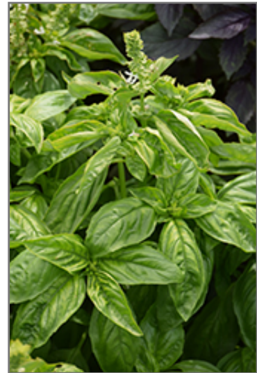
Genovese Basil foliage

Genovese Basil will grow to be about 20 inches tall at maturity, with a spread of 14 inches. When grown in masses or used as a bedding plant, individual plants should be spaced approximately 12 inches apart. This fast-growing annual will normally live for one full growing season, needing replacement the following year.