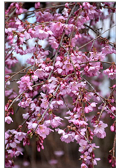
Pink Cascade Weeping Cherry flowers

Pink Cascade Weeping Cherry is recommended for the following landscape applications;