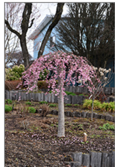
Pink Cascade Weeping Cherry in bloom