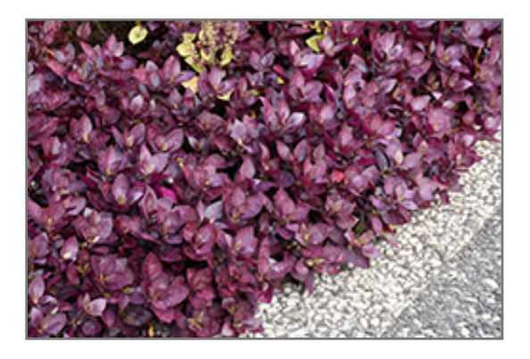
Purple Prince Alternanthera