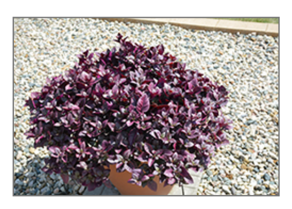
Purple Prince Alternanthera

Purple Prince Alternanthera is a fine choice for the garden, but it is also a good selection for planting in outdoor containers and hanging baskets. Because of its spreading habit of growth, it is ideally suited for use as a 'spiller' in the 'spiller-thriller-filler' container combination; plant it near the edges where it can spill gracefully over the pot. Note that when growing plants in outdoor containers and baskets, they may require more frequent waterings than they would in the yard or garden.