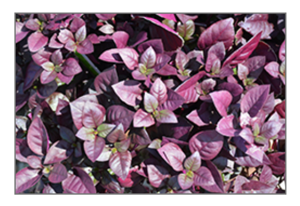
Purple Prince Alternanthera foliage

This plant will require occasional maintenance and upkeep, and should not require much pruning, except when necessary, such as to remove dieback. It has no significant negative characteristics.