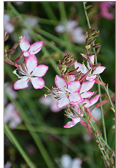
Rosy Jane Gaura flowers

This is a relatively low maintenance plant, and is best cleaned up in early spring before it resumes active growth for the season. It is a good choice for attracting butterflies to your yard, but is not particularly attractive to deer who tend to leave it alone in favor of tastier treats. It has no significant negative characteristics.