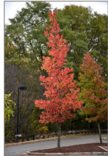
Sweet Gum in fall

Sweet Gum is a deciduous tree with a strong central leader and a shapely oval form. Its average texture blends into the landscape, but can be balanced by one or two finer or coarser trees or shrubs for an effective composition.