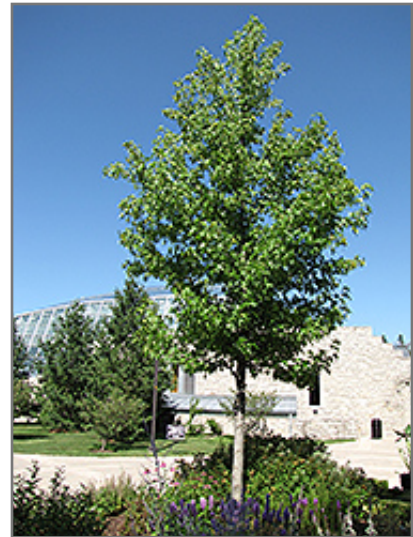
Sweet Gum

This tree should only be grown in full sunlight. It prefers to grow in average to moist conditions, and shouldn't be allowed to dry out. It is very fussy about its soil conditions and must have rich, acidic soils to ensure success, and is subject to chlorosis (yellowing) of the foliage in alkaline soils. It is somewhat tolerant of urban pollution. This species is native to parts of North America.