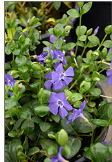
Bowles Cunningham Periwinkle flowers

Bowles Cunningham Periwinkle is an herbaceous evergreen perennial with a ground-hugging habit of growth. Its medium texture blends into the garden, but can always be balanced by a couple of finer or coarser plants for an effective composition.