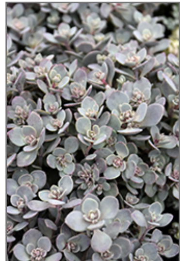
SunSparkler Blue Elf Sedoro foliage