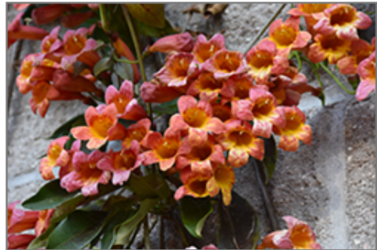
Tangerine Beauty Cross Vine flowers