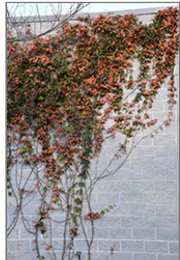
Tangerine Beauty Cross Vine in bloom