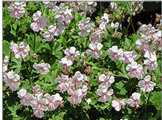
Biokovo Cranesbill in bloom

This plant will require occasional maintenance and upkeep, and should be cut back in late fall in preparation for winter. Deer don't particularly care for this plant and will usually leave it alone in favor of tastier treats. Gardeners should be aware of the following characteristic(s) that may warrant special consideration;